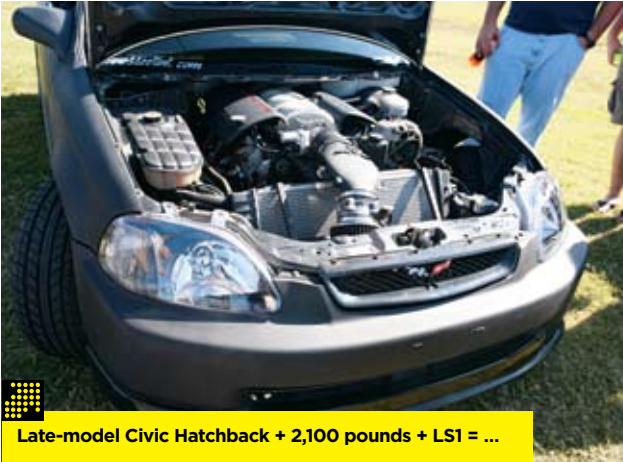
Late-model Civic Hatchback + 2,100 pounds + LS1 = ...

...The Civette, an LS-powered car that was just way too strange to pass up.