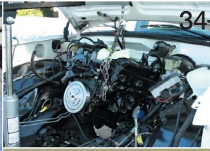
34 Marcel then hoisted the engine over to the truck and dropped it in place between the freshly painted frame rails.