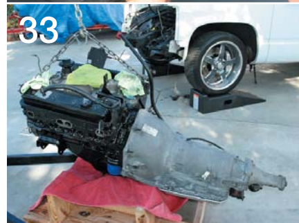
31 32 33 Once the converter was slid onto the input shaft and the flex plate was bolted up to both the crankshaft flange and converter, the engine and transmission were joined once again.