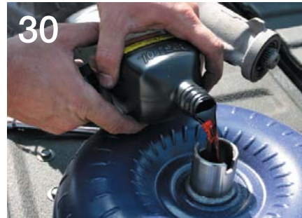
30 Before we slapped the new parts onto the transmission, the converter was filled to the brim with ATF.