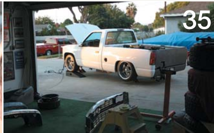
35 Our story ends here, until next month, with the truck waiting for us to install the engine accessories, plumbing, wiring, and other odds and ends that will have it coming to life.